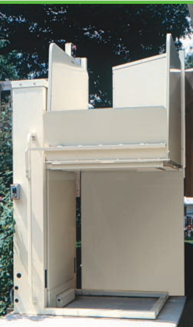
While the lift is in motion, the ramp folds. Once it arrives at a lower landing, one side will lower, allowing easy access.