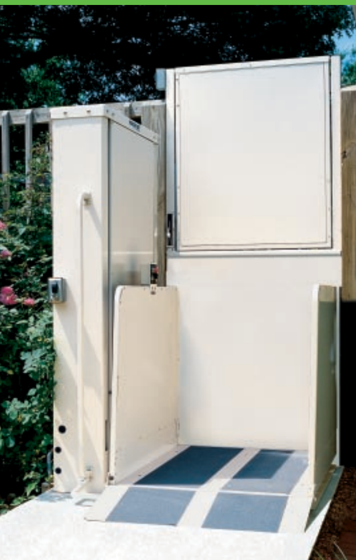
Porch-Lift platform has a non-skid surface that comes standard with an automatic folding ramp.

Spending time with your loved ones in the home you cherish is important. So when stairs become a barrier, homeowners across America turn to Access Industries for solutions that add value to their independent lifestyle—both indoors and outdoors.